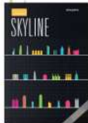
IMAGINE EXTERIORS SKYLINE (FOR RESIDENTIAL TOWERS)