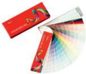
COLOUR SPECTRA FAN DECK*