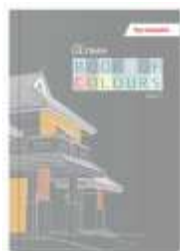
ULTIMA BOOK OF COLOUR (FOR HOMES)